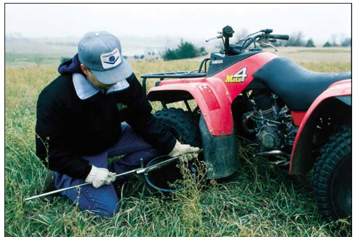
Soil Sampling—Take 15-20 Cores for One Sample