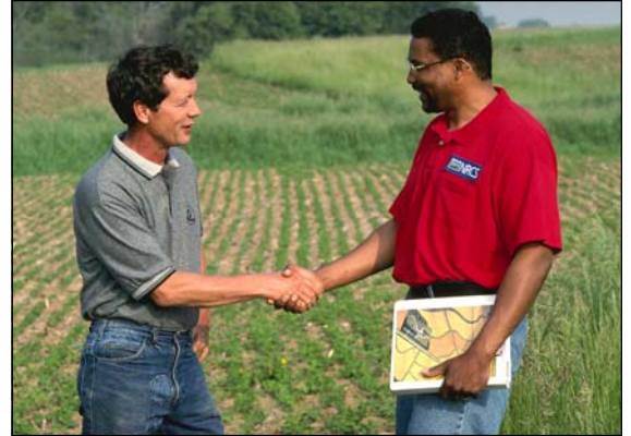
Helping People Help the Land

You may also be eligible to receive financial assistance through a state or federal program. Your NRCS office will explain any programs that are available so you can make the best decision for your operation. All NRCS programs and services are voluntary.