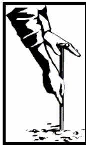
Soil Sampling Tube