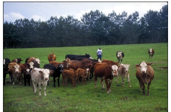
Sample Depth for Pastures is 4 Inches.