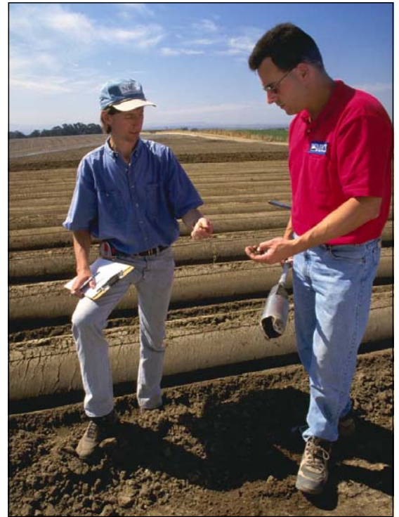
Don't Guess—Soil Test