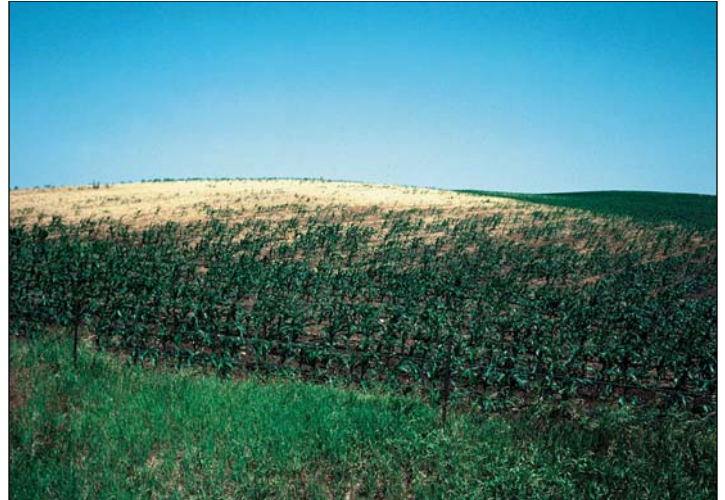
Soil Tests help to Identify Production Problems