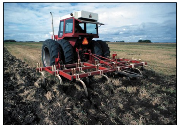
Sample Depth for Cropland is 6-8 Inches